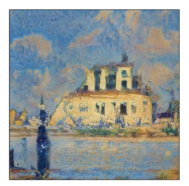
Fig. 2. Example generated with Lucid Sonic Dreams (Alafriz 2022). (<u>https://www.youtube.</u> com/watch?v=l-nGC-ve7sI).

Another way of navigating the latent space is Latent Space Interpolation, i.e. interpolating between preset positions in the latent space. While the previous Latent Space Traversal was unable to capture repetition, Latent Space Interpolations allow creating loops. Lucid Sonic Dream (LSD) (Alafriz 2022) is a system that uses this approach, similar to DMV the amplitude and shift in amplitudes are mapped to the speed of the interpolation. While looping is one of the strengths of Latent Space Interpolations this does create a repetitive experience. To circumvent this problem, LSD uses a combination of both Latent Space Interpolations and random walks. The harmonic and percussive tracks are separated. While the harmonic track is used to modulate the speed of the loops, the percussive track is used to introduce a momentary "pulse". This "pulse" is created by performing a random step as seen in the Deep Music Visualiser for one time step and then returning to interpolating to the next latent vector. An example of a video generated by LSD is shown in Figure 2.