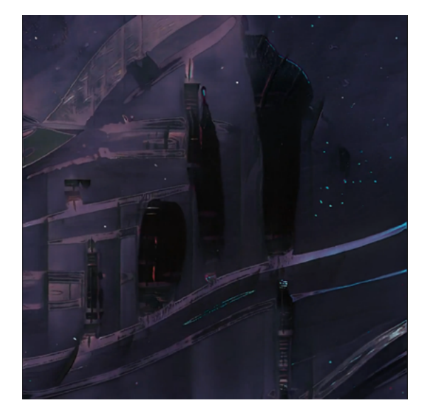
Fig. 3. Example Chroma-Based Interpolation as implemented by Brouwer (Brouwer 2020). (https://wavefunk.xyz/assets/ audio-reactive-stylegan/ rhodes.mp4).

Lastly, there is Chroma-Based Interpolation, showcased in Figure 3. Instead of using the amplitude of the audio signal, the pitches are calculated through a chromagram and mapped to the visuals. A chromagram is computed by clustering a spectrogram into frequency bins for every pitch (Ezzaidi et al. 2012; Ellis 2007). In western music theory, normally 12 bins are used. In LSD and DMV, conditional GANs can be used, where a class vector is appended to the input to define the content of the synthesised image (Oeldorf and Spanakis 2019; Mirza and Osindero 2014). It is then possible to use a chromagram to influence the content of the video, i.e. every pitch is linked to a different content class. A different approach to incorporate pitch is to map every pitch to a key-frame (Brouwer 2020). The resulting video consists of interpolations between keyframes based on the pitches present in the music. For example, if the note C is mapped to a blue frame and the note D to a red frame. At every point in the music where the letter C is played on its own the video would show the blue frame, but if multiple notes are played the two keyframes are interpolated, i.e. if we play C and D together a purple frame will be shown. The mixing ratio between keyframes is the amplitude of the responding pitches. While this approach implicitly captures repetition through the pitch, it is not able to represent atonal or monotonous musical. Without any pitch changes, the mapping will create a static video.