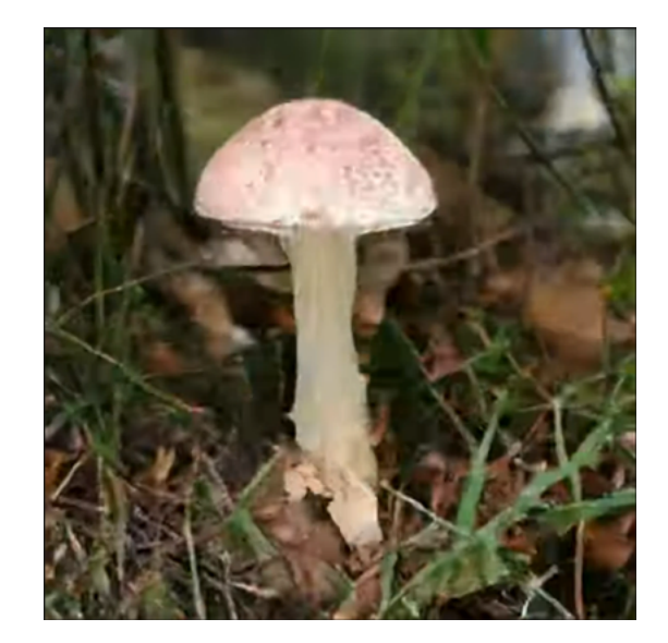
Fig. 1. Example generated with Deep Music Visualiser (Siegelman 2022). (<u>https:// www.youtube.com/</u> watch?v=L7R-yBZ5QYc).

GANs use vectors sampled from a latent space to generate images. Vectors that are close together in said space are mapped to visually similar images. By moving around in the latent space it is possible to generate smooth videos interpolating between different key-frames. Researchers and artists have used this quality of GANs to create videos showcasing images morphing from one into another. The three mentioned offline audio-reactive systems use the topology of the latent space in different ways.