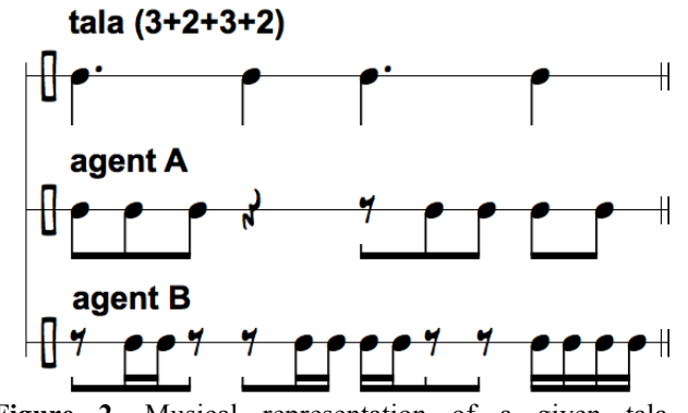
Figure 2. Musical representation of a given tala (3+2+3+2), top, and two possible patterns by agents. Agent A is limited to inner beats – onsets on and between, the tala – while agent B has subdivisions as well.