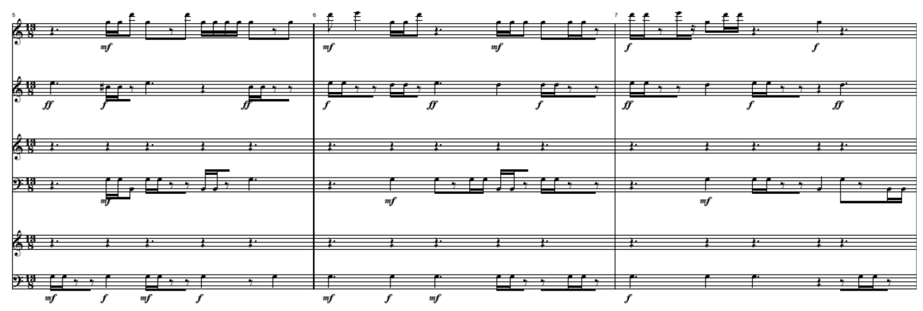
Figure 4. Three phrases of output from CT4, shown as musical notation, for two vibraphone and two marimba.

notation requires an entire measure to be complete before it can be notated and interpreted by musicians. Musicians do not read music note to note, but instead chunk notes into sequences [16]. As such, a one measure delay was required in order notate the agent interactions in the previous measure. Other practical issues – including score rendering and communication over the local area network – forced a further one measure delay.