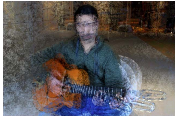
Figure 6: Image created using successive frames of a subject in motion in conjunction with camera translation.

the non-moving parts of the image remain photorealistic. One way to get around this is to combine the translation of the camera (like in our Cubist inspired experiments) with the movement of the subject. Figure 6 demonstrates a sample output using this hybrid approach.