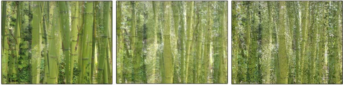
Figure 1: Demonstration of the effect of different interpolation values. Interpolation values from left to right are 0.01, 0.1, 0.9