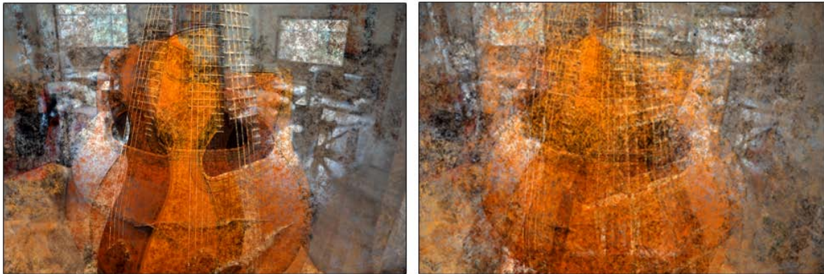
Figure 4: Images created by assigning Aesthetic Agents three (left image) and six (right image) images of a guitar from different angles.