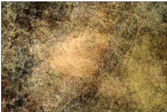
Figure 7: Abstracted image made from ten different images of a reclining nude figure.

of producing novel, high-quality artistic renderings. In doing so we demonstrated the power of biologically inspired models and metaphors to create new forms of artist expression. Furthermore, the simple implementation and effective results produced by our system makes a compelling argument for more research using swarm-based multi-agent systems for non-photorealistic rendering.