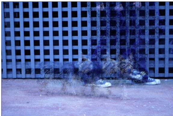
Figure 5: Image created from successive frames of a subject in motion.

To explore this Futurist concept we took successive images of a subject in motion and set the images as the aesthetic ideals for different groups of Aesthetic Agents (see Figure 5).